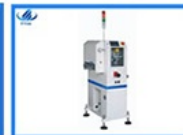
PCB cleaning machine