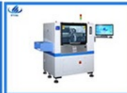
Glue Dispenser Machine