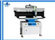
semi-auto stencil printer