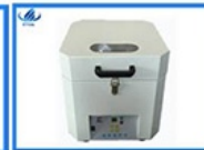
Solder paste mixer