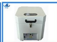
Solder paste mixer