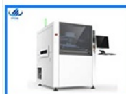
Automatic stencil printer