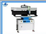
semi-auto stencil printer