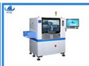
Glue Dispenser Machine