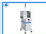
PCB cleaning machine