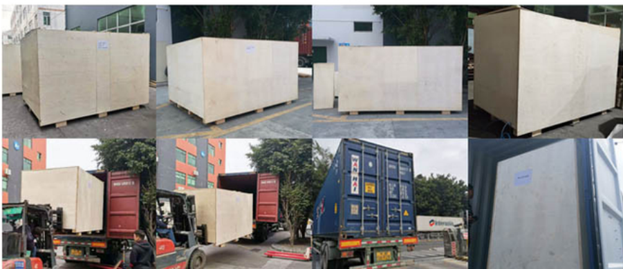
step three: professional wooden box packaging