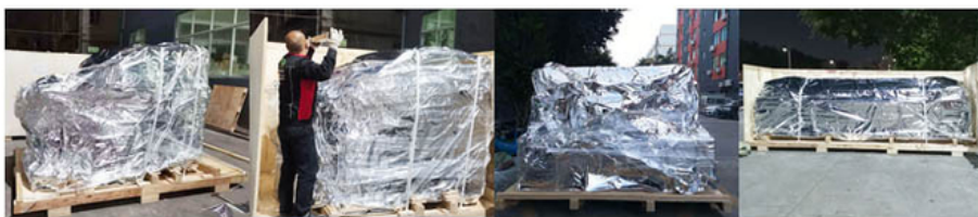
Step two: Vacuum packaging Vacuum packaging; put the desiccant in a vacuum bag to prevent moisture; use straps to secure the machine;