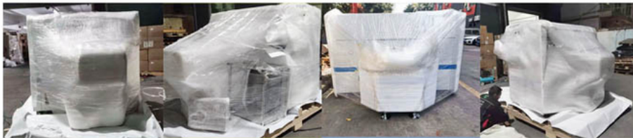
Step one: Pack the machine with foam cotton and stretch film to protect the outside of the machine