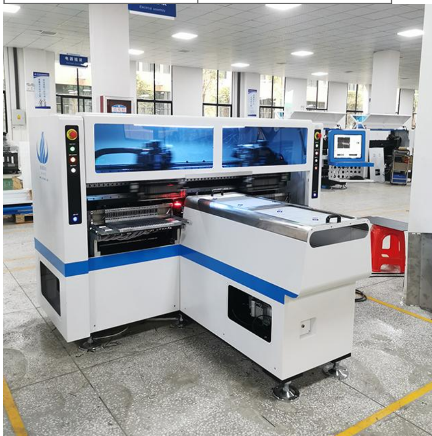
SMT Line solution