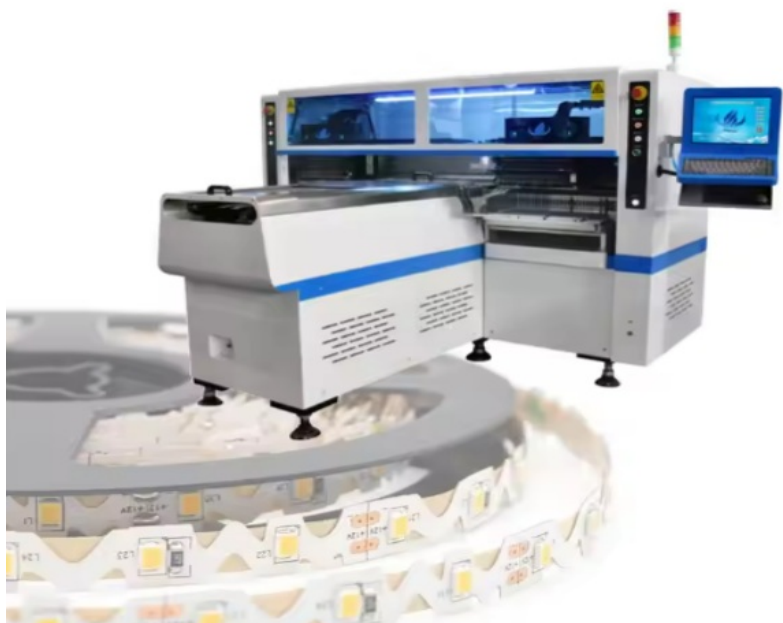
HT-F9 Semi-automatic Production Line

Producing four different materials simultaneously will not affect high productivity. It is applicable to rigid light boards of 0.6m, 0.9m and 1.2m, as well as flexible light strips of 0.5m and 1m. It can be installed once without waiting under any proportion of LED chips and resistors