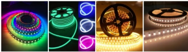
Flexible strip and Roll to Roll